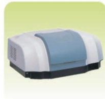
Kidney Stone Analyzer