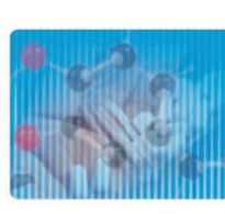
Rapid Diagnostic kits