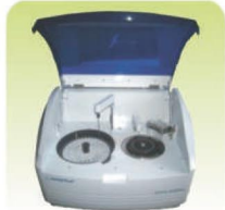
NOVA 2020 Plus Automatic Bio-Chemistry Analyzer