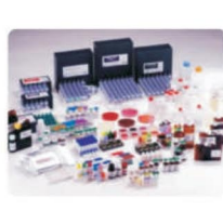
Bio Chemistry Reagents