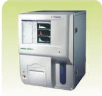
HEMA 2062 Plus Fully-automatic Hematology Analyzer