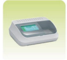
Micro Plate Reader / Washer