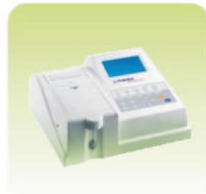
NOVA Basic Semi - Auto Chemistry Analyzer