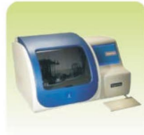
Random access analyzer for immunoassay, proteins & clinical chemistry