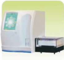
5 part Hematology Analyzer