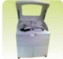
NOVA 2200 Plus Auto Chemistry Analyzer