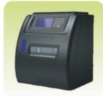
Blood Gas Analyzer