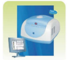
PCR/Gradient PCR/RT PCR