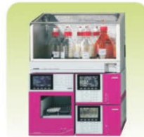
Amino Acid Analyzer