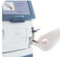
Portable POC Blood gas Analyser