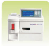
NOVALYTE 2200 Electrolyte Analyzer