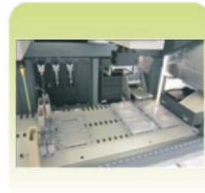
Revolutionary automation in neonatal screening